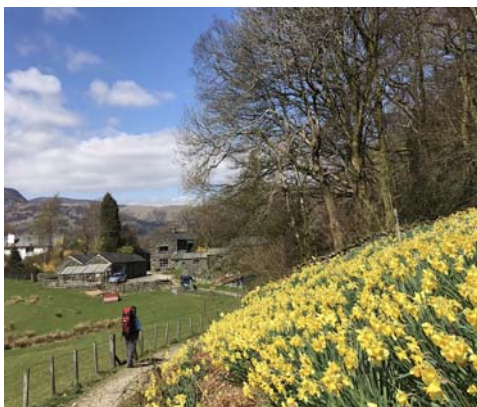
Lake District Narcissus Bank